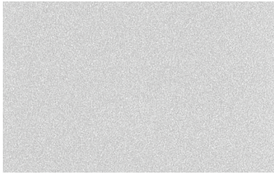
Bright Silver 399X440