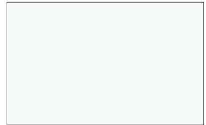
Getty White 391F178